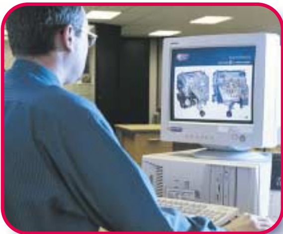
The Lex Auto Logistics operation is supported by a sophisticated £20m IT system.

Coming after an extensive evaluation period of its existing logistics operation, the move has been introduced to ensure that Dennis Eagle continues to provide world class aftersales support in a period where demands to keep vehicles in service by minimising downtime has never been greater.