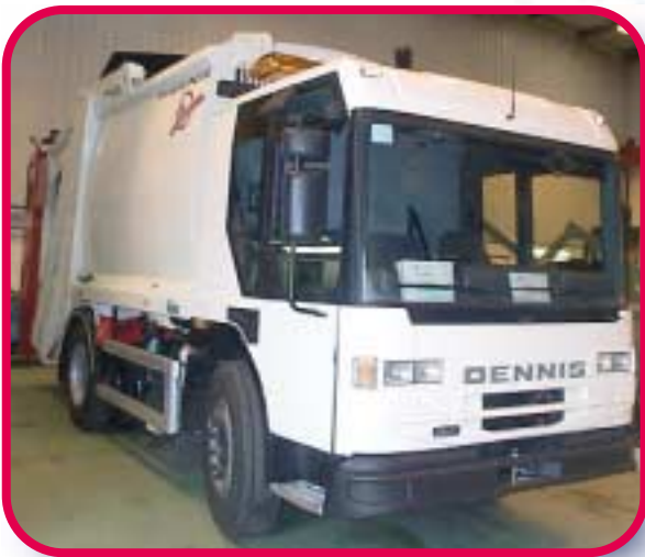
The French demonstration vehicle