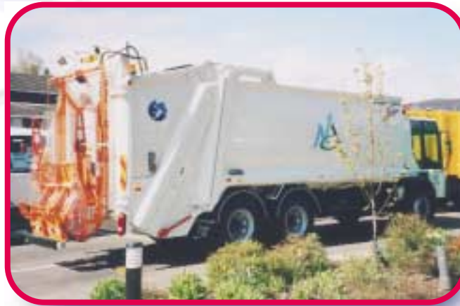
North Ayrshire District Council's Phoenix 2 23

Understandably so, Dennis Eagle had on display a Phoenix 2 23 based on the Elite chassis and bearing the