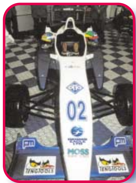
The Status Motorsport Formula Renault Racing Car on display at Manvik.

So having launched the Formula Renault Team with flying colours and already seen sales of Phoenix 2 accelerate from a racing start, it looks as if Manvik and Dennis Eagle are in pole position and on track to take the chequered flag when it comes to the Irish RCV circuit.