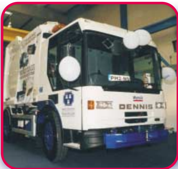
The Phoenix 2 with Euro 3 Elite Chassis in the livery of Dublin City Council. One of 55 Dennis Eagle RCVs that are on contract hire from Manvik with the council.